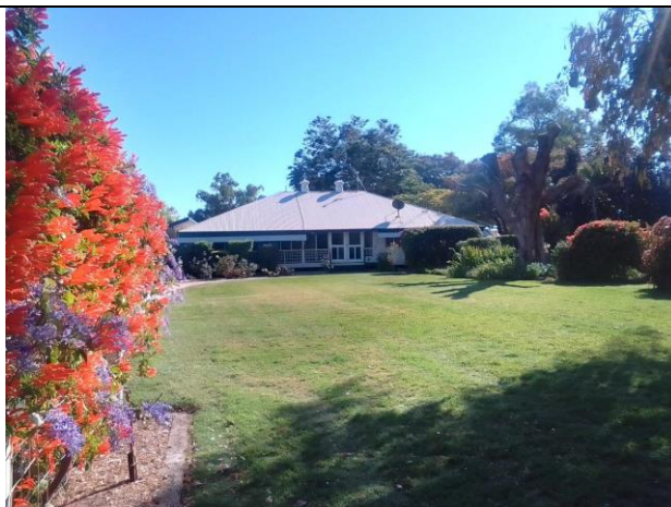
The homestead and garden