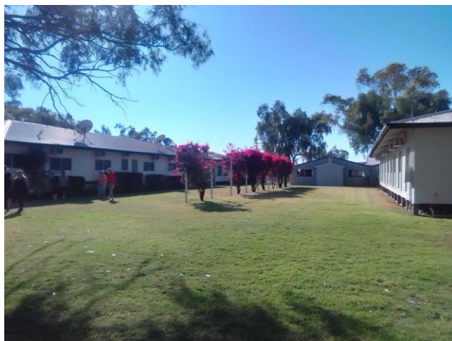
The station grounds